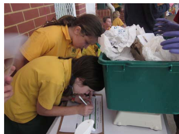
Weighing and counting rubbish items