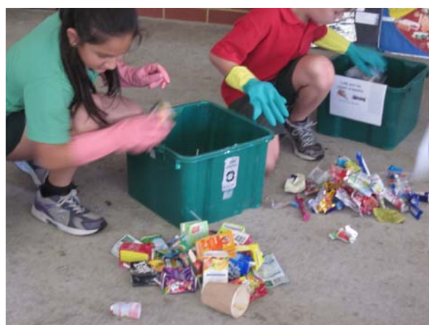
The messy job of sorting the rubbish