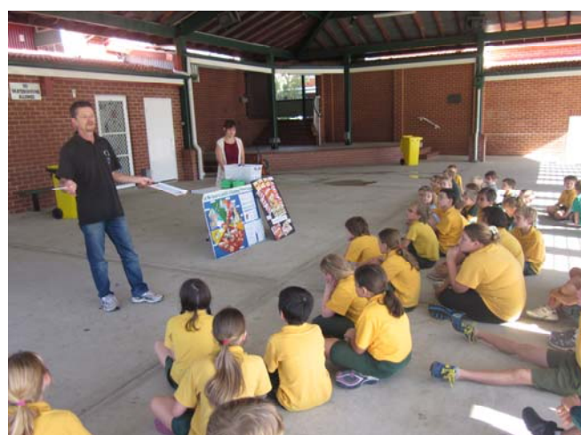
Learning how to reduce our lunchbox rubbish